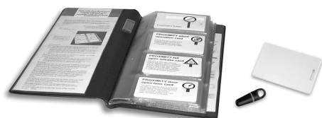
Starter Pack, Keyfobs or Prox Cards